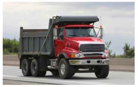
COMPASS works with rail equipment, construction equipment, fleet service vehicles, and much more.